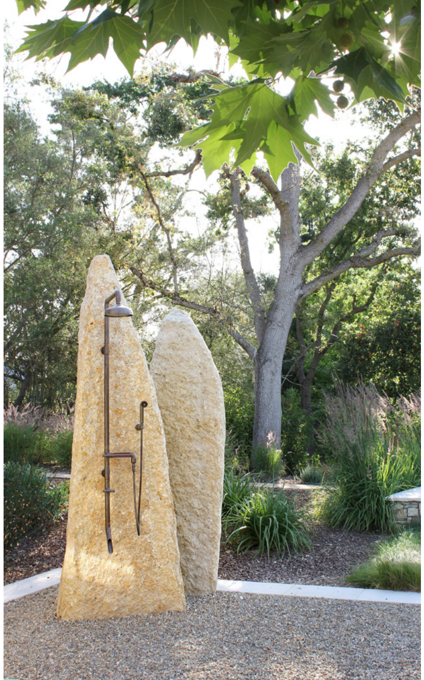
Model 180 cold-water outdoor shower from WaterBridge line in Oil-Rubbed Bronze finish

Designed with the rustic look of raw plumbing materials, the WaterBridge showers exude an industrial feel to a beautiful effect. The showers come standard with an 8-inch rainhead and tee-handle. They are specified from four standard models: Model 140 with just rainhead, Model 150 with rainhead and handshower, Model 170 with rainhead and footwash, or