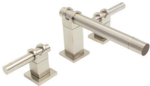
STRAP IN SATIN NICKEL