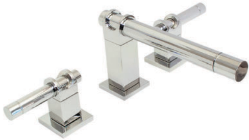
STRAP IN POLISHED CHROME