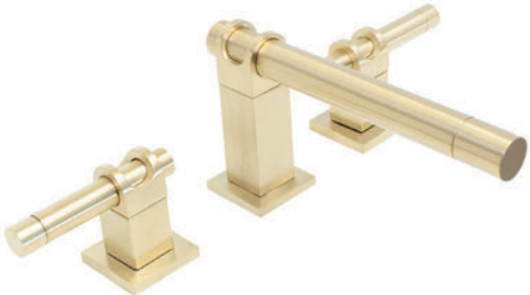
STRAP IN SATIN BRASS