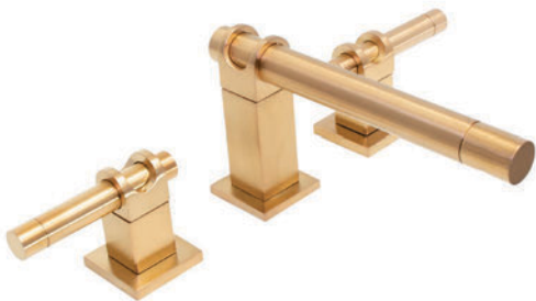
STRAP IN BRUSHED BRONZE