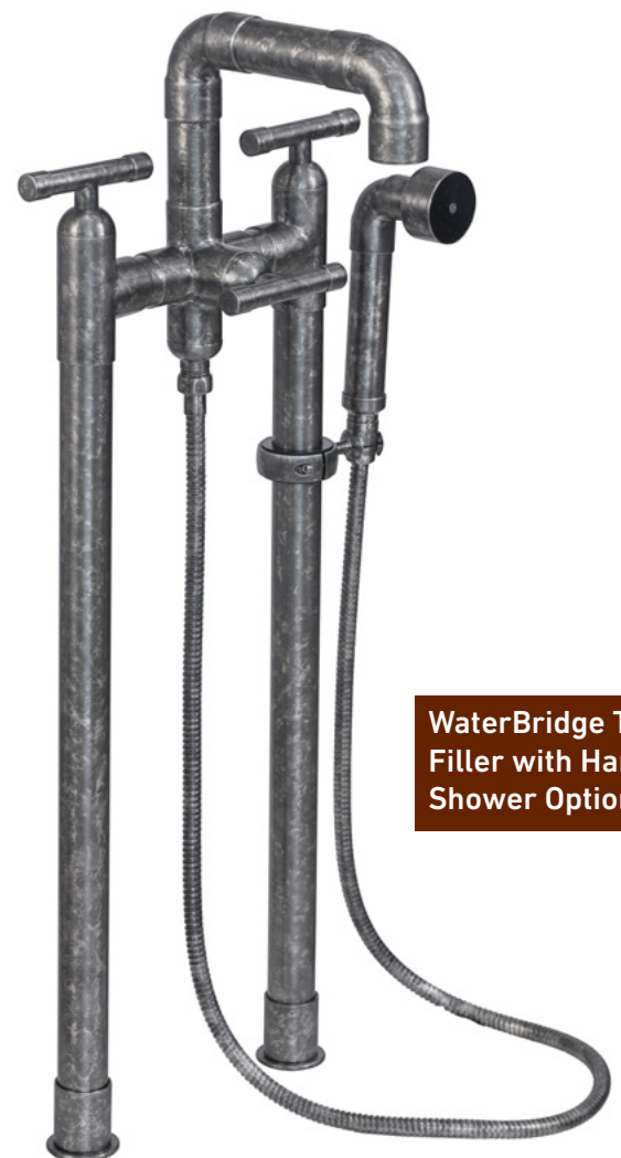
WaterBridge Tub Filler with Hand Shower Option

"Multi-purpose Hand Showers have evolved into an integral part of any Tub Filler system, but with some designs, multiple diverter valves can feel bulky and cumbersome. By replacing the tub filler and hand shower shut offs with one single diverter, we're able to create an option with a more streamlined look and more fluid operation," says Sonoma Forge president, Erik Ambjor. Repositioning the hand shower cradle also helped to create a more compact design. Instead of the traditional telephone hand shower cradle commonly used in the past, the new and improved Tub Filler models feature a Hand Shower bracket that clamps onto the leg.